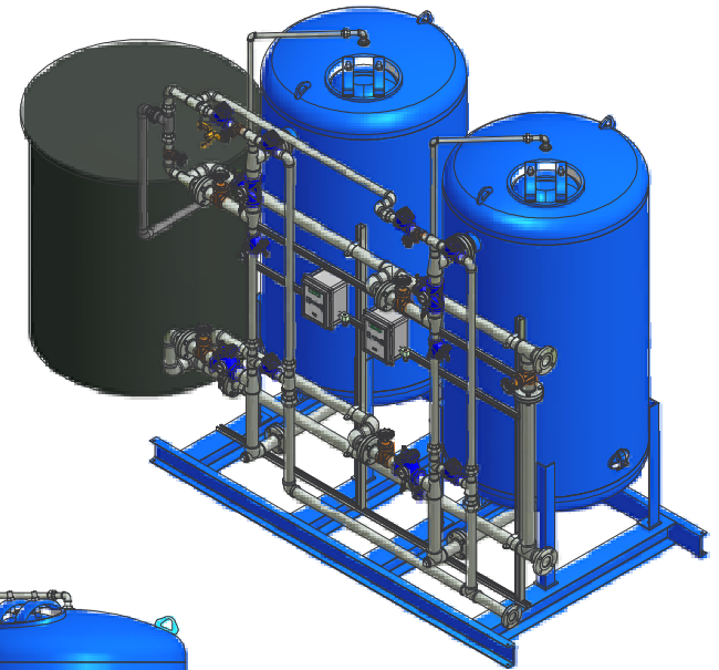
MINERAL TANK MT DIAMETER