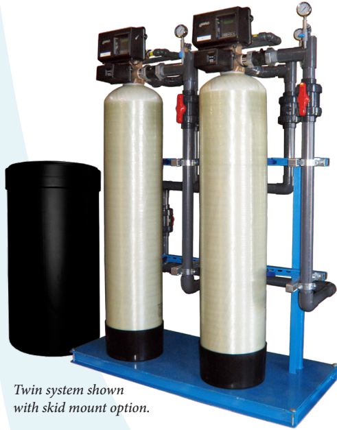
Twin system shown with skid mount option.