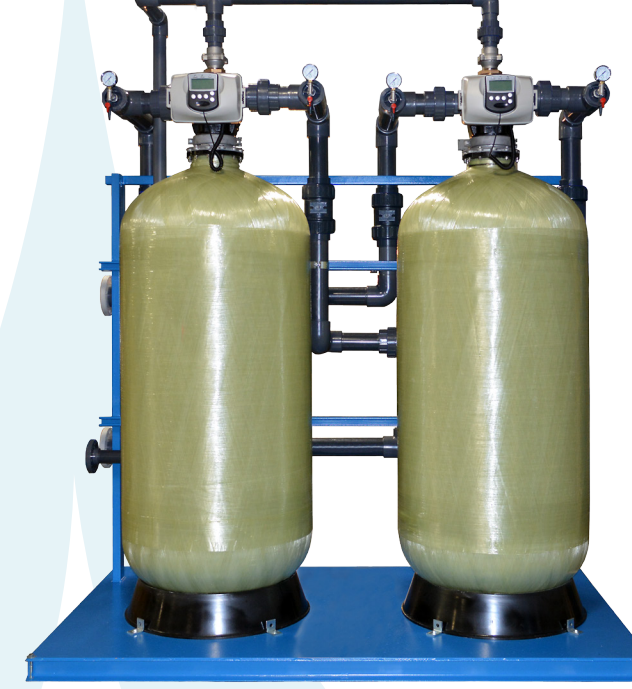
Twin system shown with skid mount option.